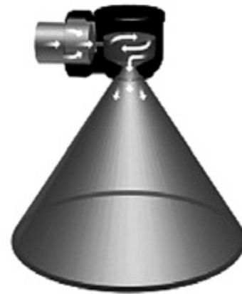
Tangential-flow hollow cone nozzles

A person (or persons) in charge appointed by the user must familiarize with user's installation and the operating personnel with the way in which the nozzle in question functions and should be handled.