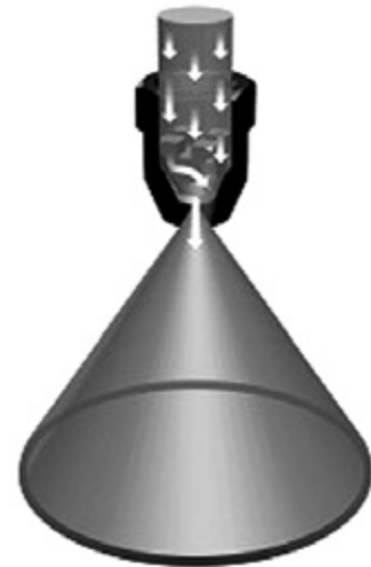
Axial-flow hollow cone nozzles